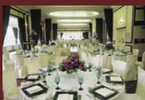
The Prince Albert Suite, London Zoo.

As selected by industry peers London Zoo – May 11th 2006 - Top 100 wealth dinner